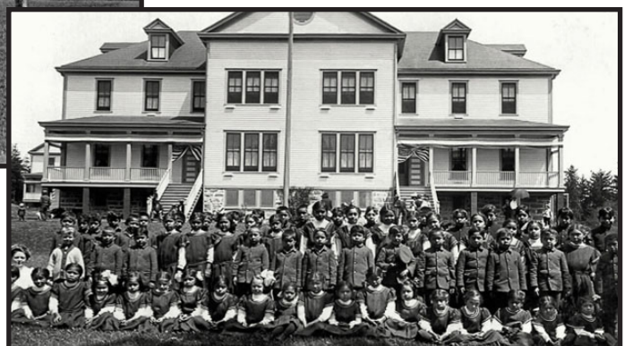
Below: Tulalip Reservation Boarding School

*Yakama is the spelling for the tribe, and Yakima is the spelling for the nearby city.