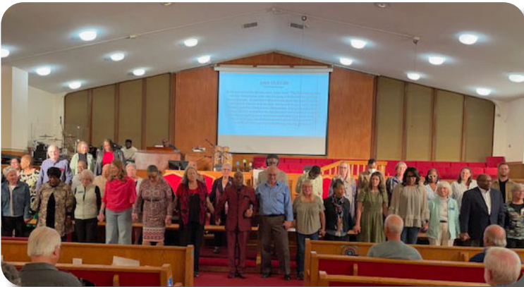
Closing prayer in unity and solidarity